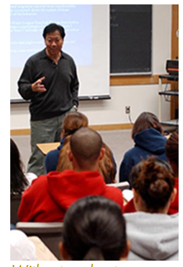
Without a plan to internationalize the campus, we cannot achieve our goal of becoming a top academic institution in the country and around the globe.

If the UC Davis administration chooses to engage in greater internationalization, it must provide clear leadership in this area and communicate effectively to the campus community that this is a high priority. It must also invest the resources and create appropriate incentive structures so that the campus community can effectively implement the necessary programs. We recognize that the campus has many goals and priorities. If internationalization is not a central priority, is would be better to scale back expectations and to make small adjustments to our current programs than to exhort change without adequate commitment. However, we believe that the campus administration will see that without a plan to internationalize the campus, we cannot achieve our goal of becoming a top academic institution in the country and around the globe.