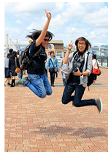
Students need our support to overcome barriers to study abroad. The University of Minnesota Multicultural Study Abroad Group characterizes these barriers as The Five F's: finances, fear, family and friends, faculty (advisors), and academic fit.

Finances. There are both real and perceived costs to studying or interning abroad. We must educate students about the real costs and provide resources to help students meet those costs.