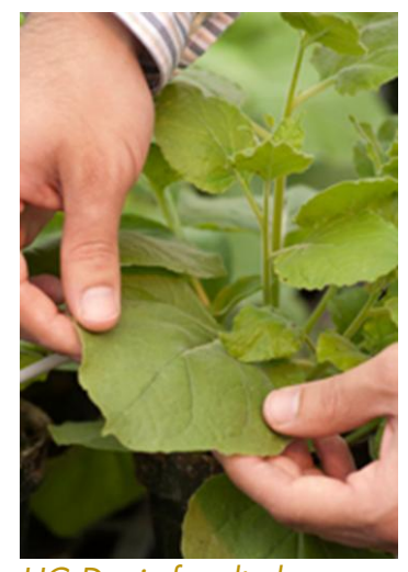
UC Davis faculty have a strong international presence; with more support and coordination this prestige would quickly increase.

One indication of our international engagement comes from Agreements of Cooperation with institutions abroad; the vast majority are established by individual faculty. Agreements of Cooperation (AOC) are broad-based working agreements that codify a