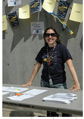
We need to understand and plan international activities for transfer students so they will not be excluded from this important educational opportunity.

Many faculty and administrators are genuine supporters of students' academic and personal growth through an international experience. However, absent an incentive structure that rewards faculty and staff for the time that is necessary to support students in their international experiences, no amount of exhortation will allow the university to achieve its goals. For example, appointing a faculty liaison in each department is a useful way to promote academic integration and to give students the impetus to participate in an international experience. The administration should consider compensation for this role – either course release time (such as one course every other year) or additional