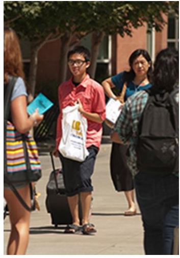
A "Living-and-Learning" community could be developed to provide specific dormitory space for California students interested in the opportunity, reserving 30 to 50 percent of the living space for international students.

1. Culture Corps: A series of projects that bring international perspectives into classrooms and onto campus through the experience and knowledge of international students: