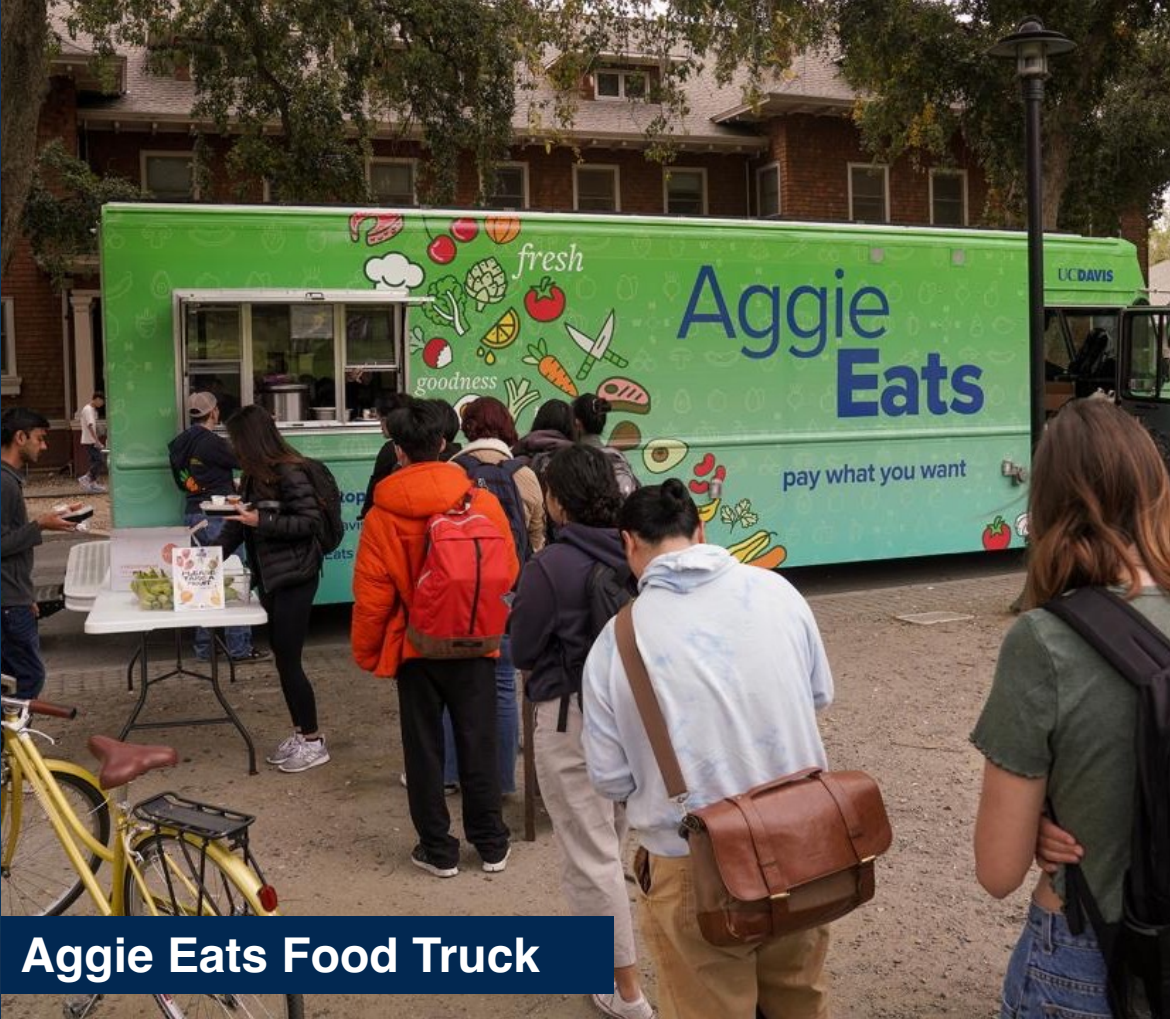
Aggie Eats Food Truck